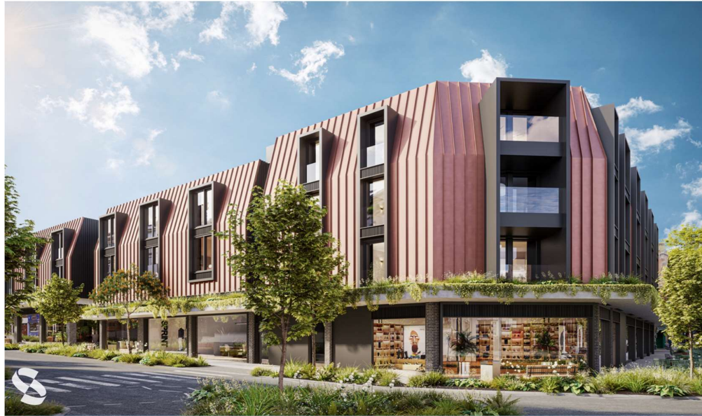
Merrial Street / Red Lion Square

Cabinet (March 25) and Council (April 25) approved the award of the construction contracts / agreements with Capital&Centric and the planning permission was also granted for the scheme in April. Capital&Centric are now procuring the contractor for the works for a commencement later in the summer. Completion is expected by the end of 2026.