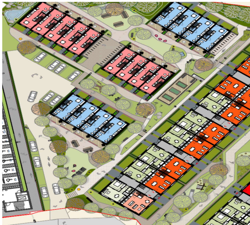
Aspire Residential Development

Cabinet (March 25) and Council (April 25) approved the award of the construction contracts / agreements with Capital&Centric and the planning permission was also granted for the scheme in April. Works are not due to start on this section until later in 2026. The residential element for Aspire will commence in the summer of 2025 and be complete by late 2026. The remainder of the site works will follow on accordingly.